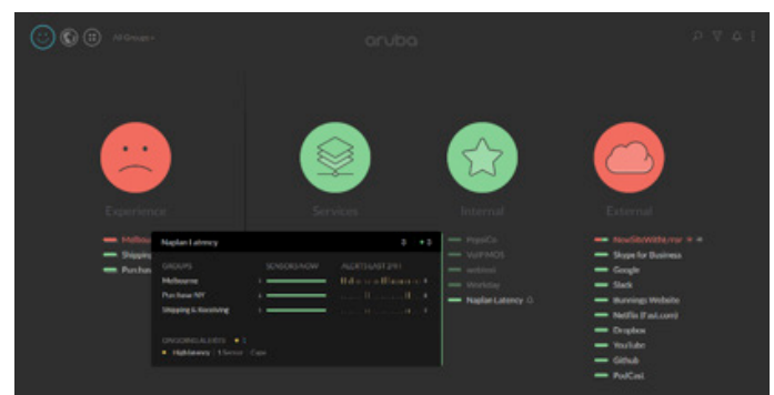
Figure 2: Aruba User Experience Insight: Administrator Dashboard

Mobile devices and IoT have become mission critical for the digital business and must be always-on with real-time access to applications and network services. To achieve this, IT needs a simple way to continuously monitor, measure, and track the complete end-to-end experience for all users or IoT devices. Aruba User Experience Insight (UXI) provides user and IoT device application assurance and rapid troubleshooting through easy-to-deploy sensors. By simulating end-user activities with admin-defined frequency, UXI sensors continuously perform user-centric application testing and store captured analytics for up to 30 days.