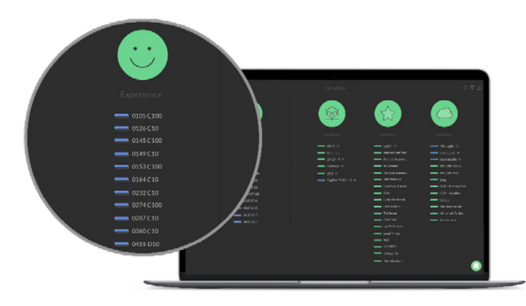
Figure 2. AIOps powered Aruba UXI helps IT teams identify priority issues with incident detection capabilities.

Al Insights on Central dynamically spots network anomalies and makes recommendations (such as configuration changes) that can deliver a 15% or greater improvement based on how the network is performing against similar sites. Al Assist can eliminate the time-consuming data collection process by automatically detecting failure events and collecting all necessary troubleshooting information and posting an alert to both the network administrator and technical support. Learn more about AlOps for smarter, efficient IT operations.