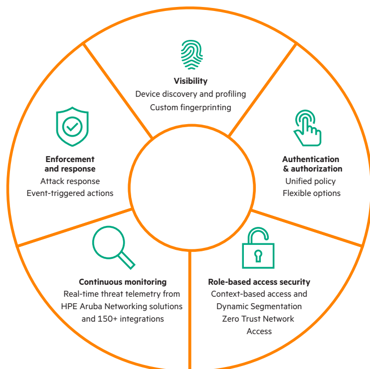
Figure 1. HPE Aruba Networking Zero Trust Security foundation

Zero Trust varies significantly depending on which domain of security is being considered. Although application-level controls are a focal point within Zero Trust, a comprehensive strategy must also encompass network security, the growing number of connected devices, and the hybrid work environment. HPE Aruba Networking ESP with edge-to-cloud security incorporates comprehensive visibility, authentication and authorization, and least-privilege access controls, as well as continuous monitoring and policy enforcement, both on and off the corporate network. Zero Trust Network Access (ZTNA), the next generation of VPN-like access, enables organizations to extend Zero Trust Security to remote locations and mobile workers.